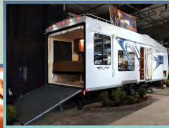
OPTIONAL: CONVERT-A-U DINETTE/LOUNGE WITH ELECTRIC LIFT AND OPTIONAL UPPER BUNK