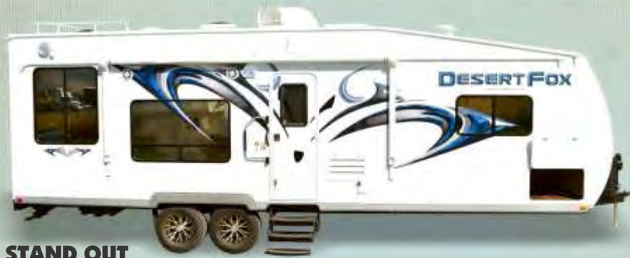
STAND OUT GRAPHICS PACKAGE