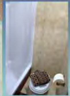
MARINE TOILET WITH FOOT PEDAL