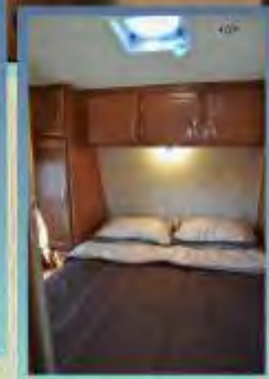
QUEEN SIZE BED