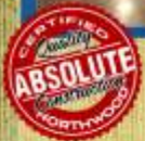
RESIDENTIAL FACE FRAME CABINETRY