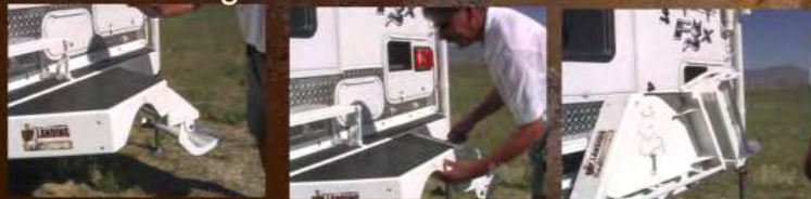
1. Steps in the down position. 2. Treads fold up... 3. ...and locks into place.

Fox Landing is now available on Wolf Creek