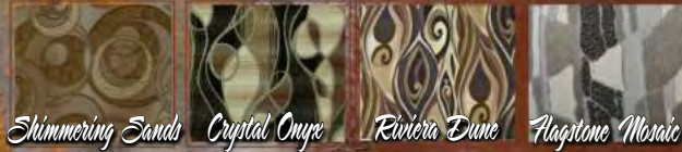
Shimmering Sands Crystal Onyx Riviera Dune Flagstone Mosaic