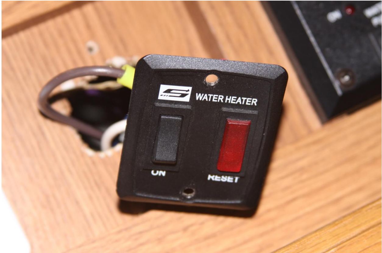
What my WH switch looks like. 2007 Model built in 2006 29-5T.